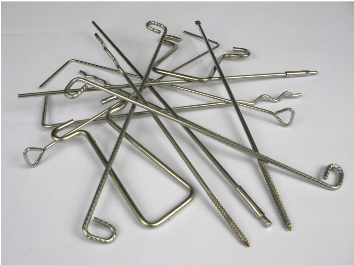
Figure 1 Steel ties

There are several different kinds and shapes of steel ties produced at Arminox. Below is a picture of steel ties with different shapes.