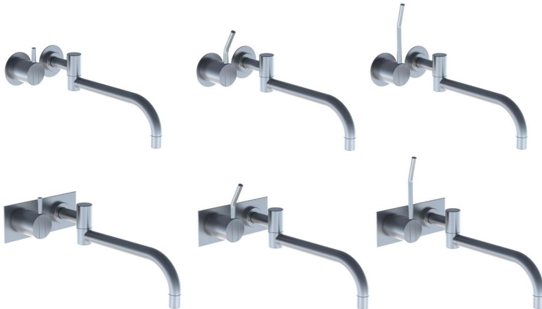
Figure 1:131, 131M, 131L, 132, 132M, 132L

Six products (131, 131L, 131M, 132, 132L, 132M) are calculated in six different surfaces (16 and 20, 19, 40, 27, 60, 64) and six product groups, see Figure 1. In this EPD the declared products are the worst-case product for each of the different product categories.