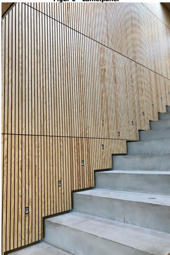
Figur 1 - Lamelpanel