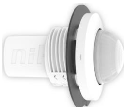
Presence P48LR DALI-2 M 32-37m FM