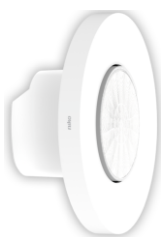
Presence P46MR DALI-2 S BMS 12-13m FMB