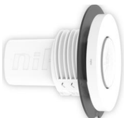
Presence P48MR DALI-2 M 12-13m FM