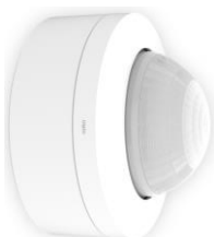
Presence P41LR 230V S 32-37m SM