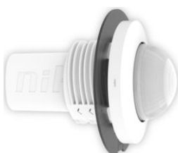
Presence P42LR 230V 2ch M 32-37m FM