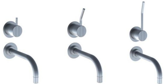
Figure 3: 311, 311M, 311L