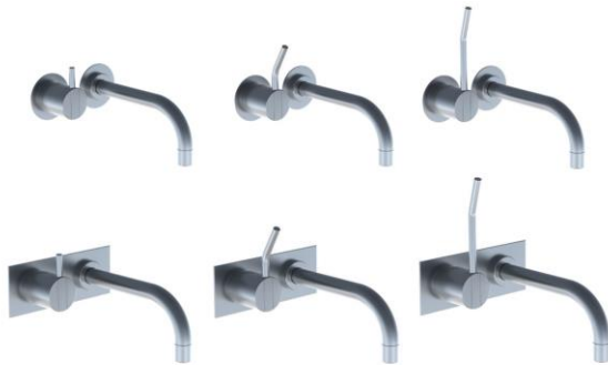
Figure 1: 111, 111M, 111L, 112, 122M, 112L

Eighteen products (111, 111L, 111M, 112, 112L, 112M, 121, 121L, 121M, 122, 122L, 122M, 311, 311L, 311M, 321, 321L, 321M) are calculated in seven different surfaces (16 and 20, 19, 40, 27, 60, 64) and six product groups, see , Figure 3, and Figure 4. In the EPD the declared products are the worst-case product for each of the different product categories.