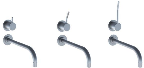
Figure 4: 321, 321M, 321L

Group 4 called "Colors" have more surfaces: Grey (02), Blue (04), Orange (05), Light green (06), Yellow (08), Dark grey (09), Mocca (12), Bright red (14), Dark blue (15), Gloss black (17), Gloss white (18), Carmine red (21), Pink (25), Matt black (27), and Matt white (28).