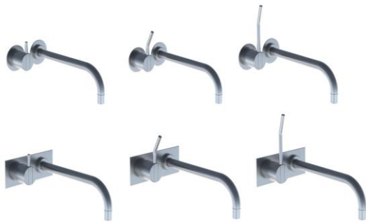
Figure 2: 121, 121M, 121L, 122, 122M, 122L