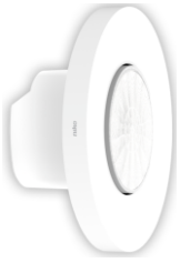
Presence P46MR DALI-2 S BMS 12-13m FMB Product ID: 353-650021