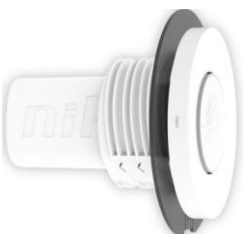
Presence P48MR DALI-2 M 12-13m FM Product ID: 353-651421