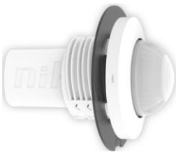
Presence P42LR 230V 2ch M 32-37m FM Product ID: 353-701221