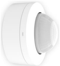
Presence P41LR 230V S 32-37m SM Product ID: 353-702021