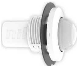
Presence P48LR DALI-2 M 32-37m FM Product ID: 353-751421